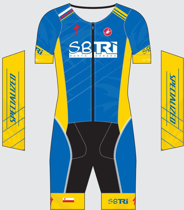
FREE TRI SAN REMO SS SUIT