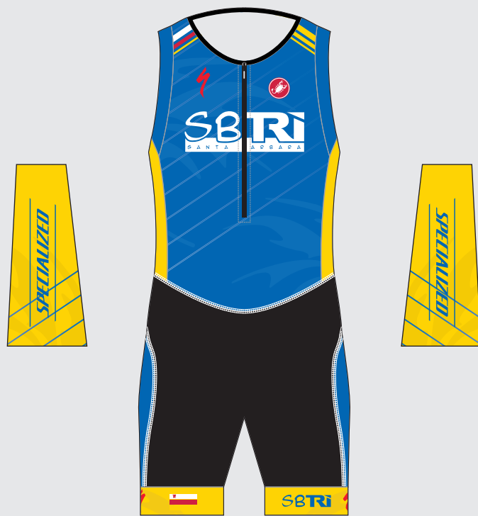
FREE TRI SUIT