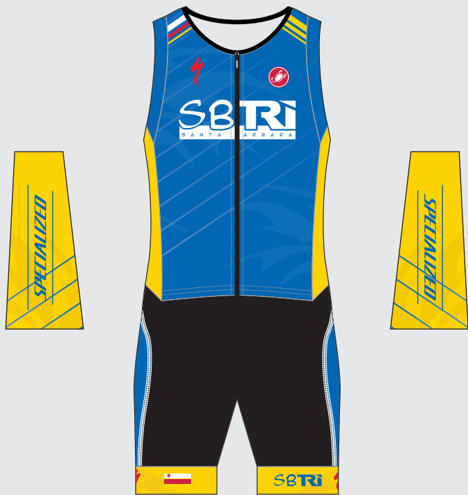
FREE TRI SAN REMO SL SUIT